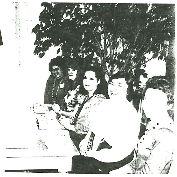
Ursuline Academy Library.