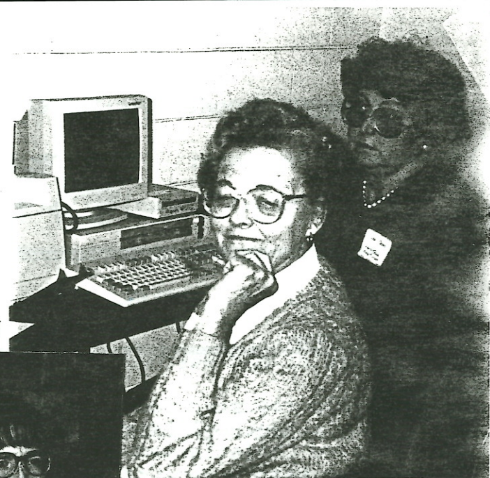
Area Librarians working