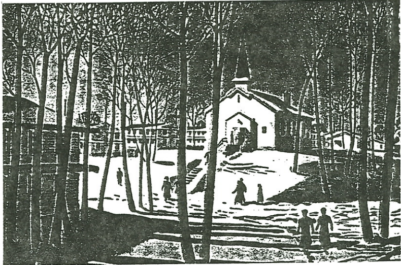
"Army Religion," by Wallace Brodeur, Life , Vol. 13, 1942. In the collections of the St. Louis Mercantile Library.

6th Floor, 510 Locust Street, St. Louis 12:15 – 1:00 p.m.